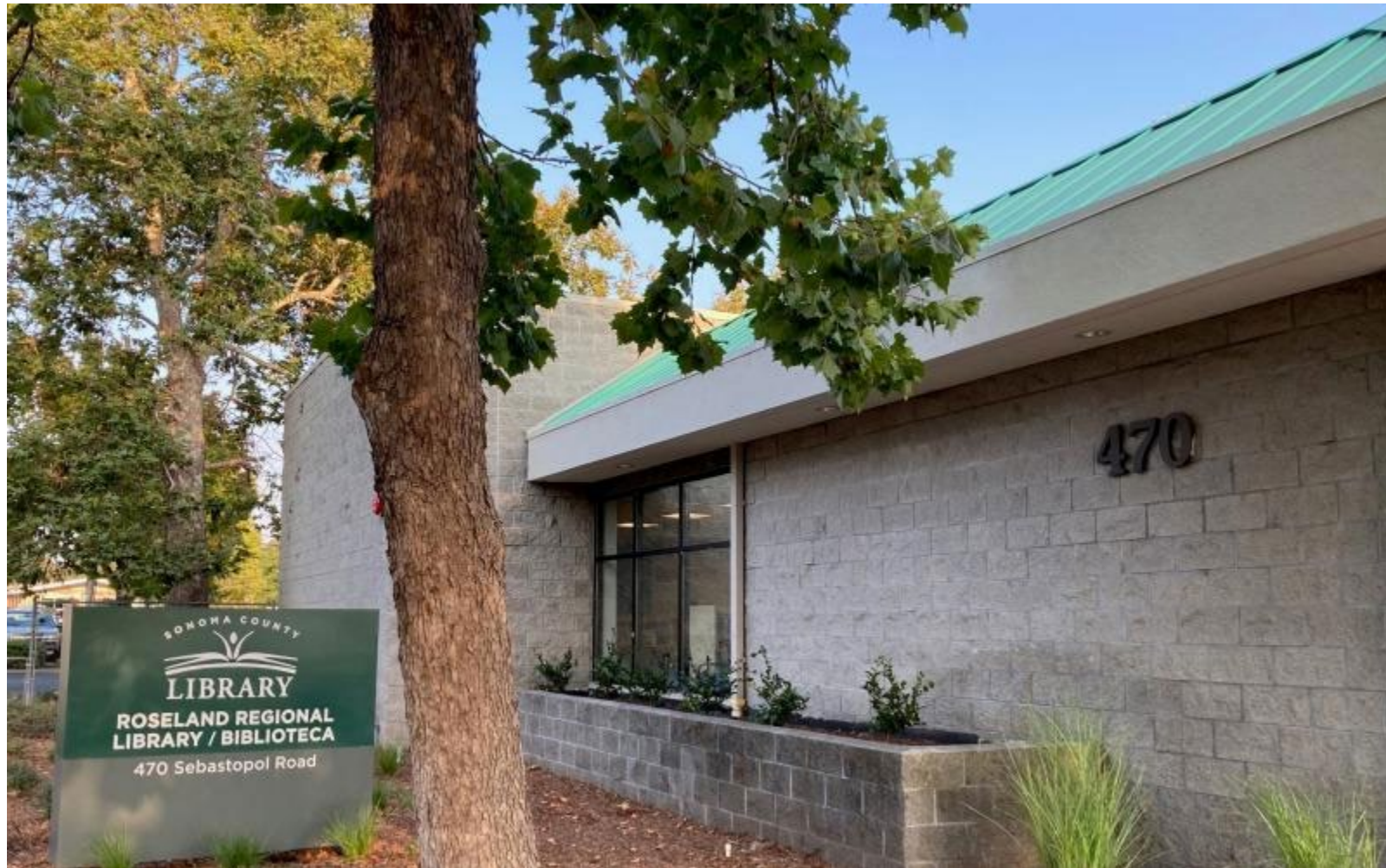
Roseland Regional Library